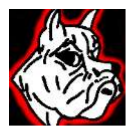
Brockton High School