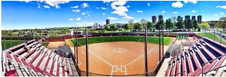
Sortino Field, UMASS Amherst

You may find MIAA 2022 Tournament Information at https://miaa.net/tournament-central/